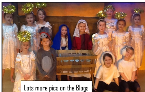
Lots more pics on the Blogs

Prior to both performances next Wednesday (2pm & 6pm) the Y1 and Y2 children will be selling Christmas decorations etc that they have made in class as part of their Enterprise Education. Doors will open 40 minutes before each show to allow parents to enjoy a good shop !!