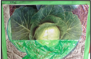
Fabulous art work from class 5