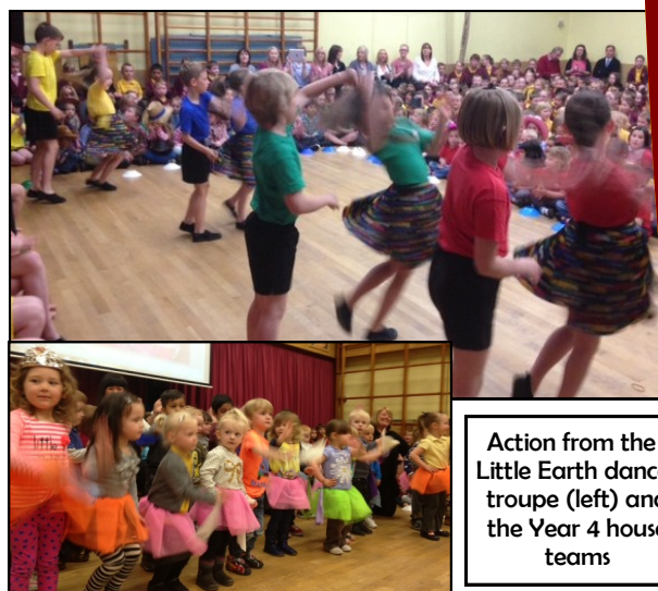
Action from the Little Earth dance troupe (left) and the Year 4 house teams