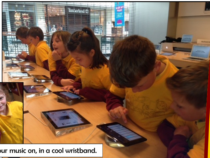
Apple gave us all a T Shirt and a Memory Stick, with our music on, in a cool wristband.