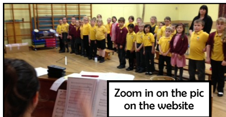
Zoom in on the pic on the website

OPERA NORTH : The children in Year 3 are enjoying learning the Benjamin Britten 'Friday Afternoon' songs (on a Thursday !).