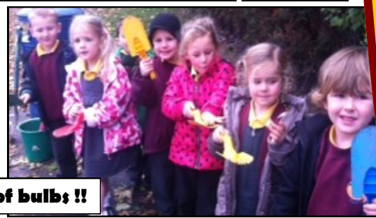
Burying 100's of bulbs!!